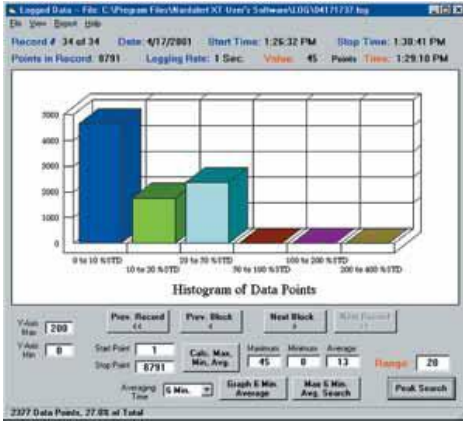
The histogram shows the distribution of data points