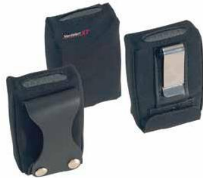
Soft cases are recommended for use by climbers and in severe weather: (l. to rt.) climber-harness case; case front; belt-clip case

This series is identical to the full-featured 8860 Series with one exception: these high power monitors function at field levels five times higher than all other model series.